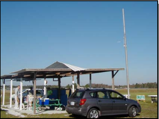
2nd roof panel still attached, but bent over.

Saturday 11-05-2005 we were able to make the needed repairs to the roof of the hut. Since we had a lot more food than helpers on the first Wilma Sausage Saturday, we froze the remaining Prime Rib & Lobster Tail and had a 2nd Wilma Sausage Saturday. Thanks for all the help guys. The field is back in action and members are coming out in large numbers.