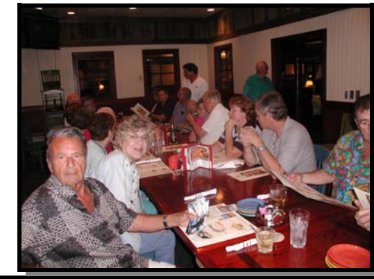
Full House at Red lobster