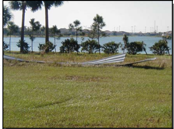
Roof panel landed quite far from the hut

Saturday 11-29-2005 was the first day any of us could make it out to the field. We had a lot of debris all over the pit area. The debris was mainly from our Chicki/Ticki hut area. One whole roof panel was blown off, and another had been lifted and bent back at one end. The Transmitter impound shelves and storage cupboard are basically a total loss, Mike Moskally has offered to rebuild the unit. After the basic cleaning up, we noticed that we are missing 2 of the green benches. No idea where they went and we're not sue if it was Wilma or some unknown parties thinking they needed them more than us.